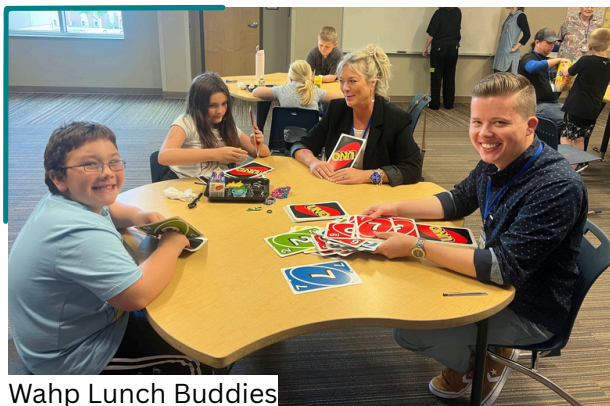
Wahp Lunch Buddies

We are thankful for our 37 mentor matches, 60 lunch buddy matches and 10 Kinship4teens members! 9 kids are currently still waiting for a mentor!