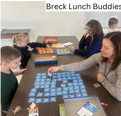
Breck Lunch Buddies