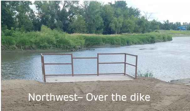
Northwest- Over the dike

Also, lots of other local locations for RIVERBANK Fishing.