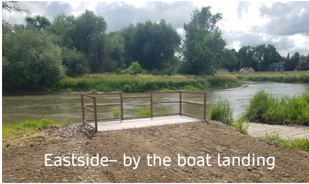
Eastside- by the boat landing